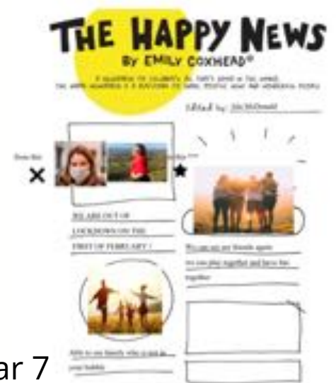
Isla, year 7