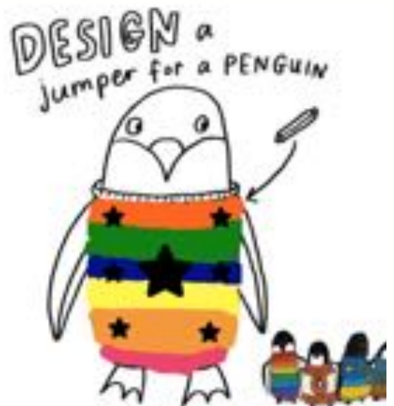
Isla, year 7

There were two winners for each competition - have a look at their amazing work!